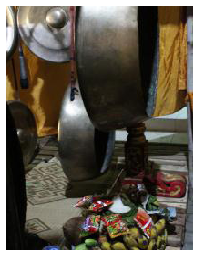
Figure 4. The offerings when performing at Pucangan, Bendan, Manisrenggo, Klaten, 20 September 2017.