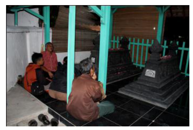
Figure 3. Pilgrimage at the Grave of Mbah Gondho Tukas, Topeng Klana Dancer and Wayang Topeng Dalang Klaten , in Manjung, Ngawen, Klaten.

Usually, the dalang always takes home some of the offerings to be shared with all the performers. Figure 4 is example of the offering in a wayang kulit show.