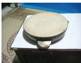
(b) rebana sedang .

The beat of rebana is the basic musical element of kasidah . Not only does the music structure become varied but the plays and singers also are informed how to perform the song by varying the beats. Rebana -s controls the performance of song, especially for rebana sedang (b), and accompanies it with steady tempo when performing.