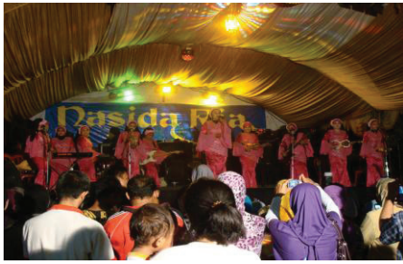
(d) Nasida Ria Kasidah Modern group.