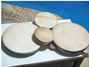
(a) rebana -s percussion instruments.

Kasidah performance mainly consists of different sizes of rebana -s (sometimes called terbang in Javanese) and singers. Its instrumental ensemble mainly consists of several rebana -s with small, middle and big size (a). That is the basic organization of kasidah instrumental ensemble, and also an instrumental organization of a small kasidah group. Certainly, the number of instrument will be increased with the degree of ensemble organization be expanded.