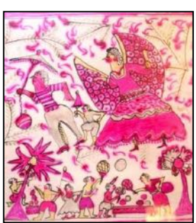
Figure 1. Damar Kurung paintings Nyonya Muluk 's Theme by Masmundari Source: Personal Documentation from Omah Damar Collections, 4th April 2016