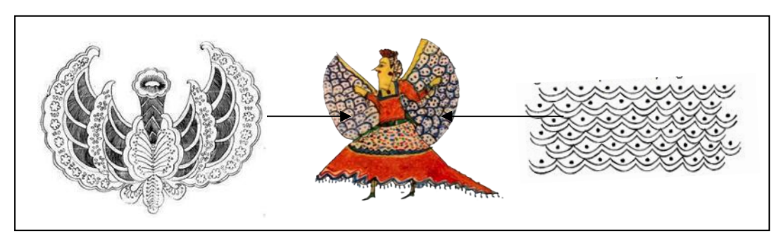
Figure 3. Gurdo motif batik, isen-isen sisik melik and Nyonya Muluk's wings

died in 2005, meaning she has the experience of first hand a period of Dutch and Japanese occupation.