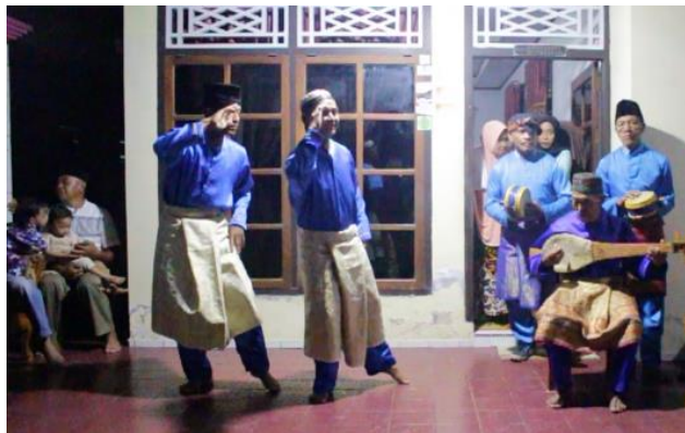
Figure 5. ragam hormat (the gesture of salute), becomes the favorite phrase to explore. This gesture is intended as a symbolic tribute to all whom present and involved in the event.