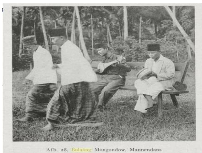
Figure 1. The original presentation of Dana Dana Bolmong , taken by Dr. Kaulder Waltren (Swedish ethnographer) while visiting Bolaang Mongondow around 1913 – 1917 Source: Document of Tegela, Kotamobagu, 2020

To enrich the students’ sight towards the contemporary concept, I direct them to do the improvisation and exploration out-of-door using the gardens and courtyards. It is also to bring their feelings closer to the original context of the presentment of Dana Dana Bolmong . For some reason, only three of the six phrases of the Dana Dana are succesfully explored, as shown by figures below: