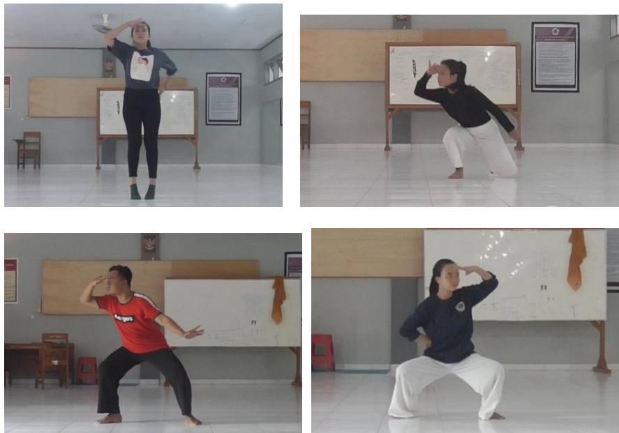
Figure 6. some poses of movement development from the ragam hormat (the gesture of salute), which is the most dominant in students' exploration