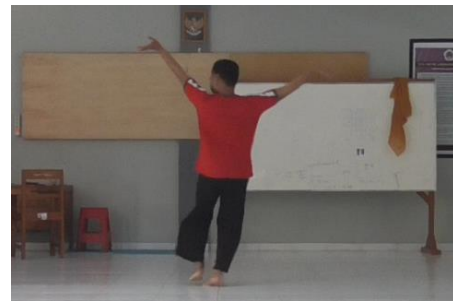
Figure 7. some poses of movement development from exploring the essence of ‘spinning’, which bring the initial articulation of spiritual realm – a sufi dance like

The choreographers are strongly advised to accompany their work with a “choreographic diary” (rather than a ready-read manuscript), which implies the background, improvisational experiences, and artistic tendencies, as well as the attitude to life from which the ideas of their works originate. This is to underline that the human mind and body are one unit, so that a choreographer is not only skilled in moving and dancing, but also able to think reflectively. Within a work process like this, choreographers are able to create artistic and innovative works that can also make meaningful changes for themselves, the community and the environment where they live (Murgiyanto, 2018, p. 256). Although the research does not enforce the ready-made dance piece, each student-participant produces a complete structure of a 7-minute dance presentation. Surely the presentation is a raw model to elaborate in further artistic works, but it is done for now as they show their ‘new’ understanding on the concept of contemporary choreography. Using digital camera and practical editing tool such as CapCut , Power Direct , and Vegas Pro , the student submits their works online.