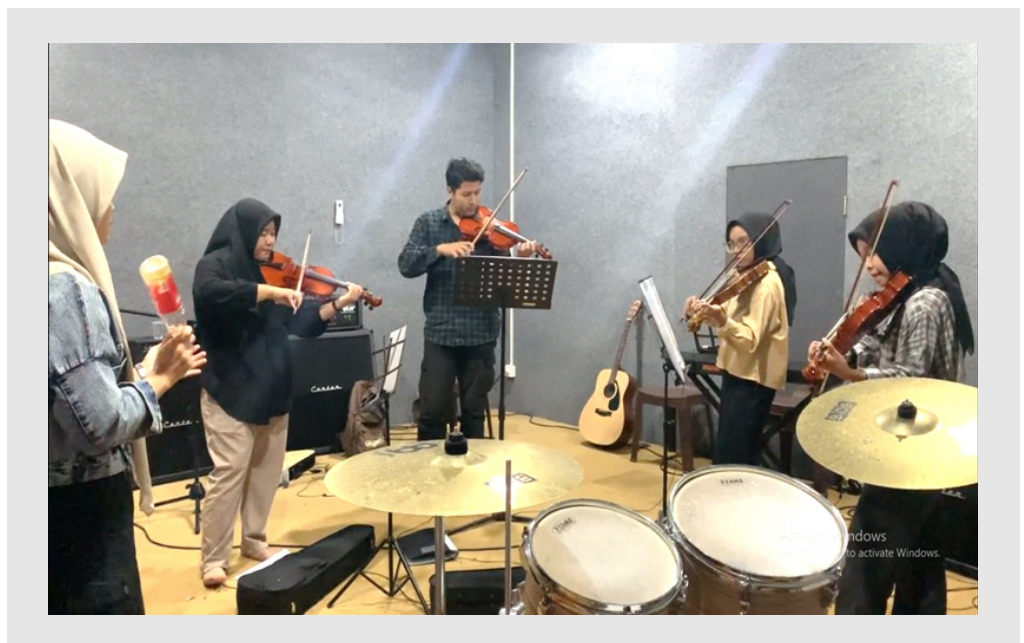
Figure 1. Cycle 1 (practice playing scales, intervals, and etude 1. Documentation: Fela Vio Mimanda, August 31, 2023)

students got a complete score in the "good" category and 3 students got a score in the "sufficient" category. Judging from the number of students, namely 5 people, the average of their ability to aim for the tone is still classified as sufficient (B-). This means that the ability of students to aim for notes in playing string instruments still cannot be said to be successful or has not reached a complete score. However, when compared to the results obtained during the pre-cycle, students experienced an increase in progress in this cycle 1 which amounted to 10.8. Therefore, the action will be continued in the next cycle.