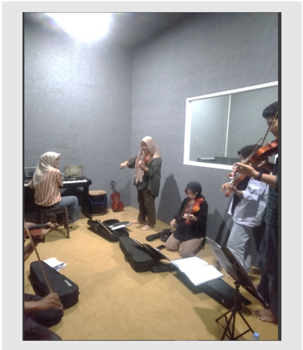
Figure 2. Cycle 2 (practice playing scales, arpeggios with piano accompaniment. Documentation: Fela via mimanda, September 14, 2023)

The table above shows the total average score of students' abilities on each assessment indicator after the action in cycle 2. The following description is that all students have received a complete score. There are 2 students got a complete score in the "very good" category and 3 students got a complete score in the "good" category. This means that the ability of students to identify and aim for notes in playing string instruments has increased much better and significantly compared to the scores in the pre-cycle and cycle 1. From cycle 1 to cycle 2 the average increase in scores from a total of 5 students was obtained, namely 19%. Therefore, based on the observation data during the research, it is found that the students' ability to aim for notes in playing string instruments has increased from each cycle.