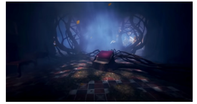
Figure 3. The big tree, cut in half, at the center of the castle. (Source: author's personal screenshot. Time taken: July 12<sup>th</sup>, 2018)

Freud (1922) theorizes that the mother's bosom is a major source of the baby's obsession and pleasure (p. 17). While taking in the mother's warmth from her bosom, the baby can also feel the thrill of being up high above the ground. According to Lichtenberg (1998), this also serves as another