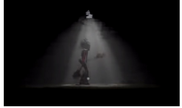
Figure 5. The mother turning into a monster, with the camera distorted. (Source: author's personal screenshot of the game. Time taken: July 12<sup>th</sup>, 2018)

The ending scene also shows the contrast between the mother and the baby's fate. The mother is still trapped in her own hysteria and possessiveness, whereas the baby has let go of his attachment to his mother. There, the baby is shown to have woken up from his dream early in the morning. His toys are missing from his room. He gets out from his dropped crib and traverses through the house, which is now filled with labeled cardboards. Downstairs, in the dimly-lit kitchen, he finds the mother hunched over a counter, sobbing between an empty bottle of alcoholic drink and the teddy bear, whose right arm is missing as a result of the mother (as a monster) ripping it while trying to snatch him away from the baby at the end of the warehouse dream world (see figure 6). If the baby proceeds to approach her, she will scream, "Stay away from me!" and shove the baby away from her with force. At this moment, the baby's