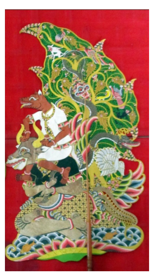
Figure 8. Kayon Sona Srenggala , Bambang Suwarno collection.

The shape of Kayon Sona Srenggala (figure 8) is described as follows: Kayon form use asymmetrical balance, Kayon position leans more to one side. The palemahan (base) of the Kayon connected with lengkeh . The base is colored yellow and green and is connected to