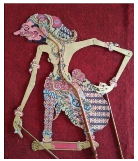
Figure 7. Adult Sengkuni, Bambang Suwarno collection.

A mapak -type neck where the neck is around 45 degrees, haughty shoulder, slouching stomach that is leaning forward, and using kalung penanggalan (figure 7). The belt ties of suwelan types which is almost used by kings, nobles, and giants (Haryanto, 1991: 111).