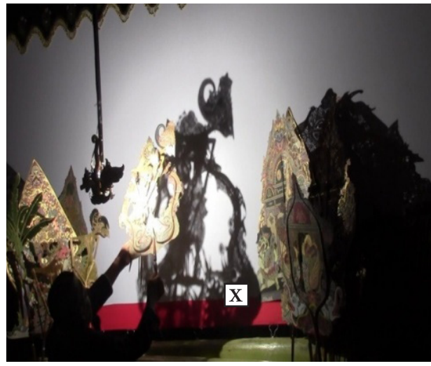
Figure 2. Kayon Klowong (X) to show the focus of the wedding of Airlangga and Retna Galuh figures in Surakarta City Hall on January 25<sup>th</sup>, 2019.

The use of Kayon Klowong in The Banjaran Prabu Airlangga play by Bambang Suwarno at the Surakarta City Hall is to show the focus on the marriage of the figures of Airlangga and Retna Galuh (see figure 2).