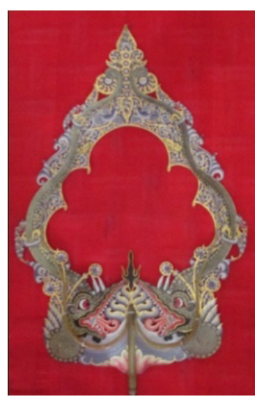
Figure 1. The Kayon Klowong made in 1986 with the outer side 43.5 cm x 65 cm, collected by Bambang Suwarno.

The shape of Kayon Klowong (figure 1) has the shape of a kayon or gunungan (like mountain) that is smaller than the size of a gunungan in general. The Kayon Klowong by Bambang Suwarno have the size of 43.5 cm x 65.5 cm on the outer side. Kayon Klowong was created in 1986 to support the Trisno Santoso stage with the play of Rama Bargawa (Kurniawan, 2008: 93). the initial name of Kayon Klowong is Kayon Kabut Sutera Ungu (interview with Rudy Wiratama, dated on April 15, 2018 at 18.00). Kayon Klowong form has been widely spread among the puppet masters.