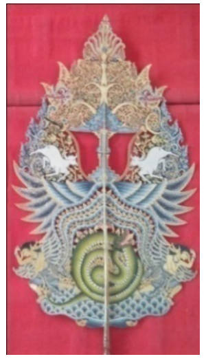
Figure 3. Kayon Hakékat created in 1987 with the outer side sized on 34cm x 58.5cm, collection of Bambang Suwarno.

The contours on the part formed in a straightforward manner without the edge of the gunungan . A hole is made in the center part intentionally to add to the aesthetic shape of the kayon . The elements at the bottom of the gunungan are formed from water stylation which forms like a cloud. At the bottom there is a snake that is spiraling with the head facing the upper right, while the tail is facing the lower left. On the left and right of the snake there are two winged humans. On top of the spiral-shaped snake ornament is a stylized ornament resembling a stupa that connects the bottom and the