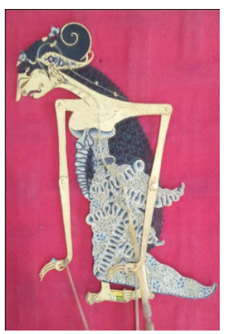
Figure 5. Kunthi Wanda Nggarbini made in 1986, by Bambang Suwarno. (Source: Bagaskoro Ardhi, 2019)

The neck part uses a mayat where the neck is inclined towards the front with 30° angle. The neck part is connected to the pundhak mlered. Necklace ornament formed by non penetrated carving. The neck uses the shape of the stomach that seems to fall backwards. The clothing used is in the form of samparan that seems slack. The kemben (torso wrap) uses udet sembuliyan landhung that seems long and the footsteps seem wide. The accessories on the hand only use the gunung sapikul ring, while the foot do