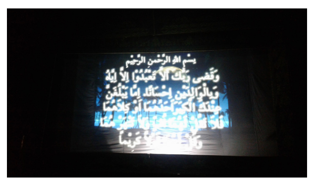
Figure 3. A display of Al Qur'an text in TWS stage.

After reciting a Qur'an verse which becomes its basic story, it continues to drama scenes. The performance of drama scenes is actually an adaptation of text book and a book which tells Salman Al-Farisi story. Besides, some hadist and content of Barzanji books are strengthening message of its historical story. Barzanji is a book which praises the prophet Muhammad. Its content is used to depict a figure of the prophet Muhammad as told again by Salman Al-Farisi and his companions at the end of the story. The drama scenes of Salman Al-Farisi are using multimedia packed in a such way by a director and writer to strengthen a message of the story.