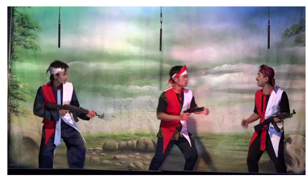
Figure 6. Transculture in TWS performance, characterization of Betawi, Java and Madura.

Indonesian language is used to make players easier to memorize the dialogue when playing in front of non-Madurese people. Jihad Resolution has ever been performed by using Indonesian language in some places like Banyuwangi, Jember and Surabaya. When