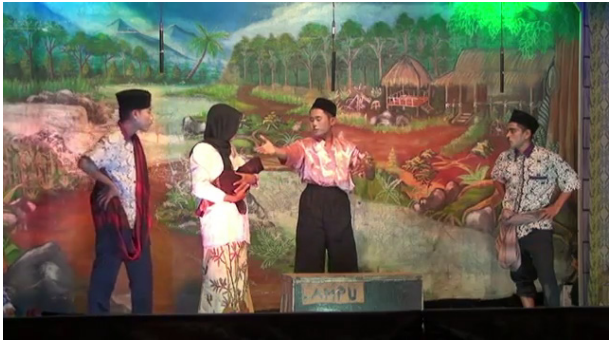
Figure 8. Transculture in the story of Syeikh Maulana Ishaq.

Like a creative process of Jihad Resolution, process of adaptation in the story of Syeikh Maulana Ishaq also begins from oral text (Kyai