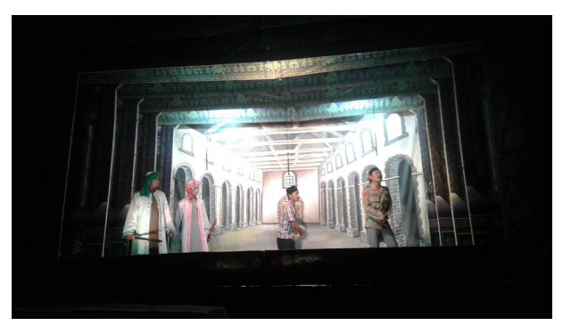
Figure 4. Transculture in TWS performance.

"There is an advice from Kyai, Islam shows Middle-East costume, Middle-East people and then the Kyai said: "enjâ' ta' papa jârèya