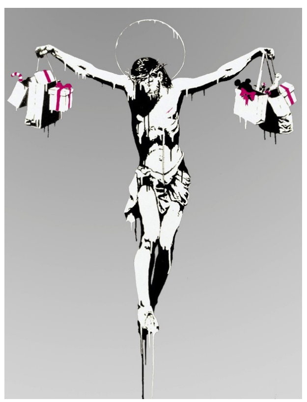
Figure 3. "Jesus Christ with shopping bags" showing the figure of Jesus Christ carrying shopping bags, illustrating the reality of consumerism in Christmas celebrations.

(1) The use of popular cultural icons are combined with certain symbols related to the