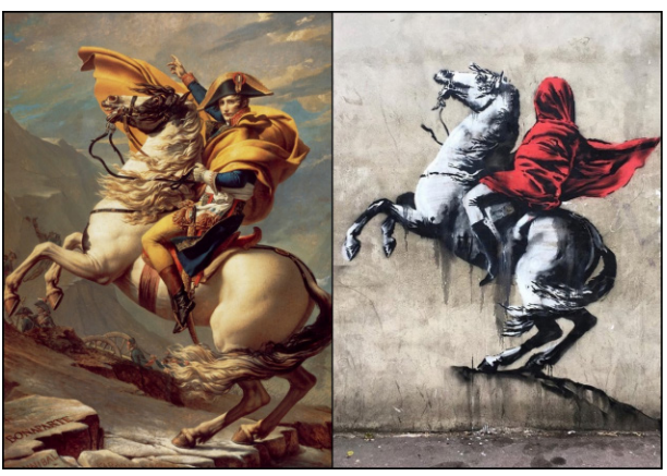
Figure 1. Banksy's parody on Napoleon's painting, a form of resistance against esthetic domination as well as strategic efforts to depict reality.