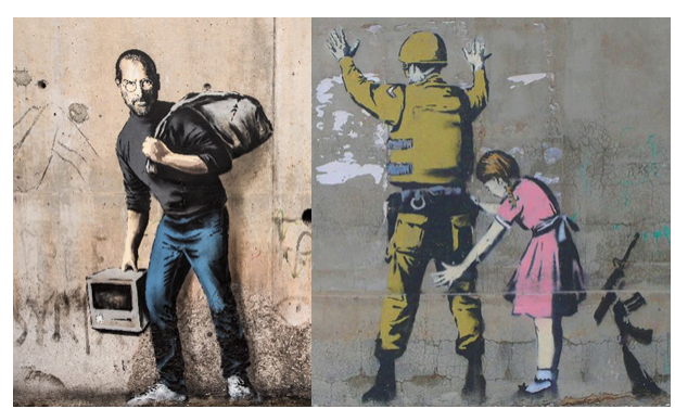
Figure 2. Steve Jobs, founder of Apple (left). A soldier and a child (right). The use of certain figures are intended to reinforce certain messages.

(4) His works are always displayed in strategic locations that have relationships or closeness to the meaning to the work displayed; therefore, the message of the work becomes stronger and more effective.