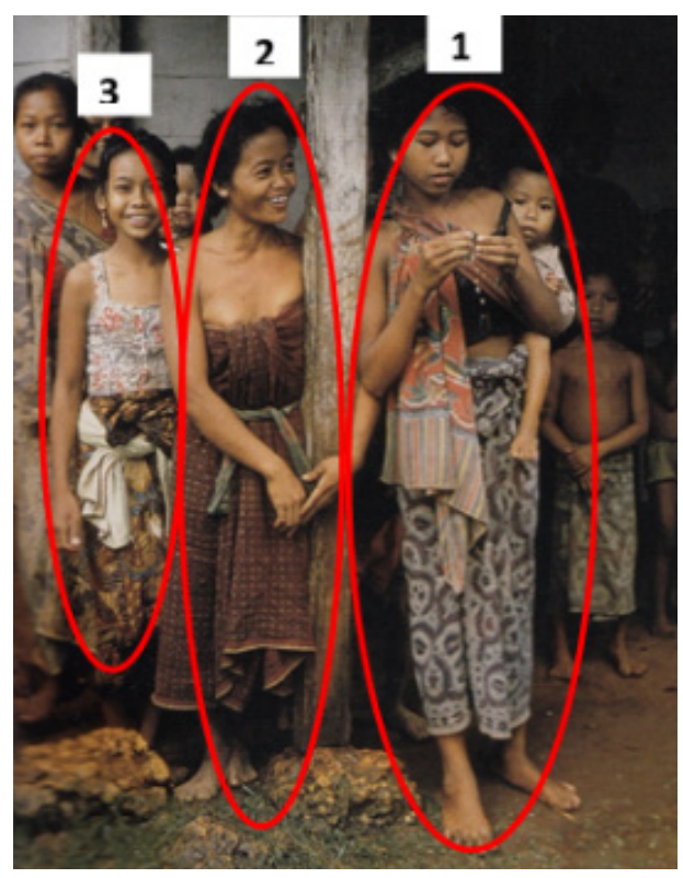
Figure 6. Cloth as an indicator of identity and social status in a community.

Figure 6 shows three Tuban women wearing the original batik jarit made by the Tuban community. The jarit worn by the woman number 1 indicates that she comes from a high social status family. In addition, the woman is wearing a dark blue camisole top while carrying her child behind her using a printed batik cloth. The second woman (number 2) comes from a family with low a social status; she wears gedog woven fabric to wrap her body and protect her chest using only one piece of cloth wrapped around her body. The young woman