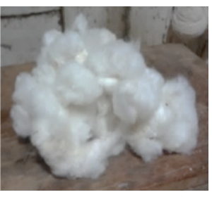
Figure 4. Brown cotton fiber ( lawa ) and white cotton fiber ( lawed ).

The availability of cotton for the sustainability of the traditional gedog batik cloth tradition in Tuban is important because it contributes to the continuation of the activities of spinning yarn and weaving fabric. Cotton and traditional fabric in Tuban have a strong culture that dates back to "ancient" times. People used to grow their own cotton fiber, spinning and weaving it into sheets of fabric. Therefore, maintaining the culture owned by the community is actually the right way to preserve the tradition of making such fabric.