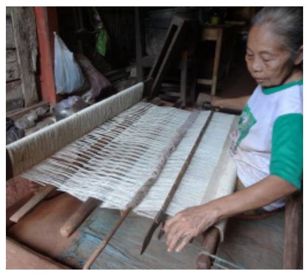
Figure 5. Gedog weaving activities by a woman in Tuban.

Like the weaving gedog tradition that exists in Tuban, it does not have values that are contrary to the rules and philosophy of life of the local community. However, its complex process can be a strong reason why traditions are abandoned and replaced by new traditions that are able to produce similar products without being constrained by complicatedness and long lead time.