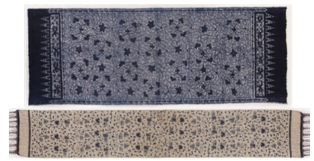
Figure 2. Design of Jarit (top) and Sayut (bottom) Unique to Tuban.

Traditional Tuban fabric designs are made to adapt to the usage of the fabric. The main usages of fabric for Tuban people are as a sayut (shawl cloth wrapped around the shoulder to carry goods) and jarit (a cloth covering the body by wrapping it around from the upper chest to the ankles). Until today, the design of sayut and jarit has never changed in terms of shape and size. The shift occurs in the choice of material by not using gedog batik woven fabric for sayut and jarit , but using printed- batik fabric. This is because the weaving