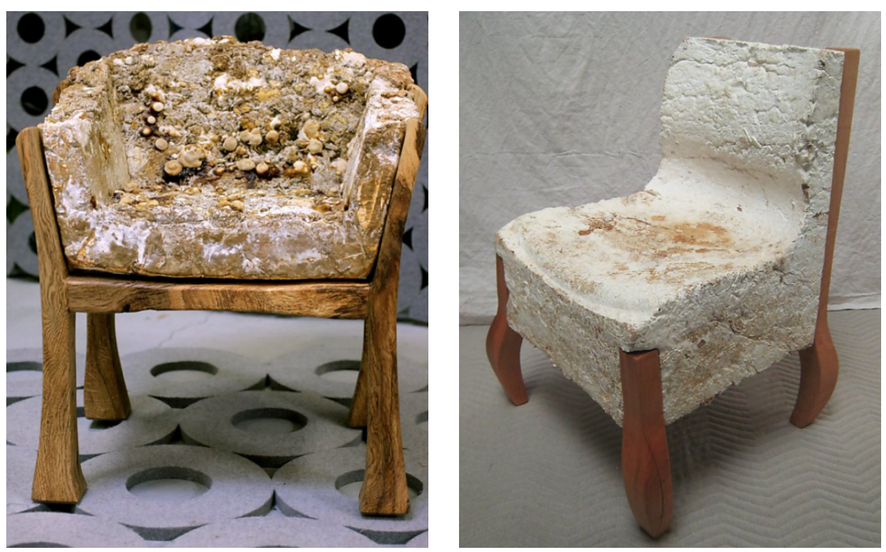
Figure 6. Organic furniture by Philip Ross is mushroom-based.