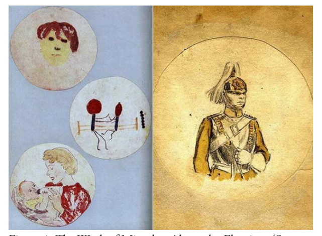
Figure 1. The Work of Microbes Alexander Fleming.