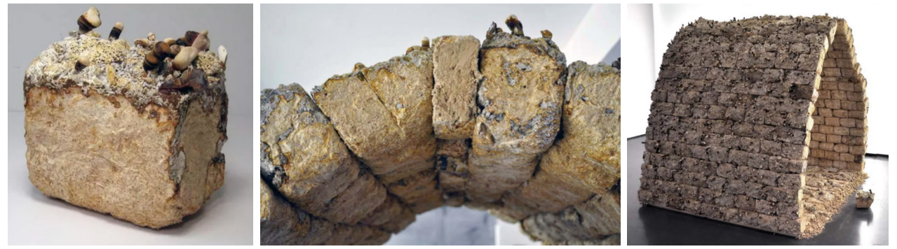
Figure 5. Philip Ross's mushroom bricks and arches formed from mushroom bricks by Philip Ross. (Source: https://www.treehugger.com/mycotecture-mushroom-bricks-philip-ross-4857225 accessed on July 9, 2021, at 09:10 am)

the three 'spheres of sustainability' is 'aesthetic sustainability' that involves the factors of 'living a naturally good life', 'culturally acceptable', and 'aesthetic-communal tradition' (Zafarmand et al., 2003). Through the decomposition process carried out, there is a continuous organic process that can be optimized into renewable materials. Most importantly, does not cause excess waste and is safe for the environment. He called this a future material where the availability and regeneration of this material do not take long enough, like wood, plastic and others. Not only using the bio medium as a character, but art-based ecological control (Eco-art) is also a concern of Ross.