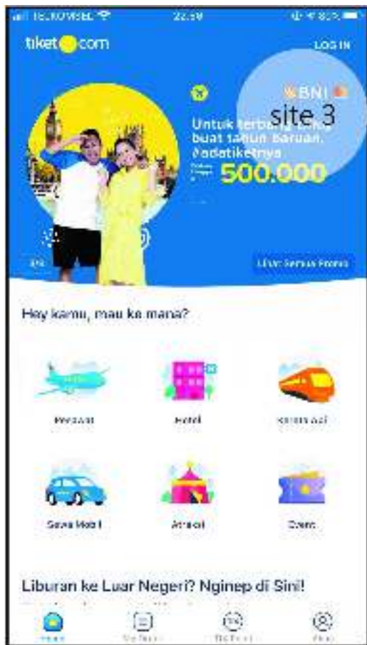
Fig 2. Object of research (Site 1, 2, and 3)