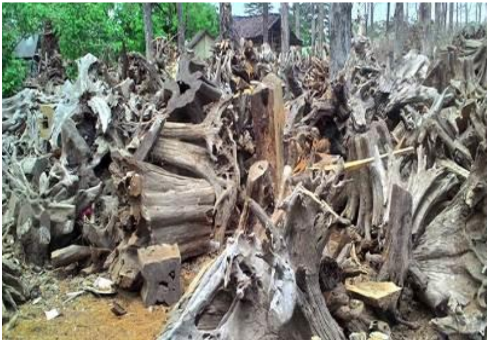
Figure 8. Waste wood pieces, twigs, and wood roots.

In his research, Judge asserts that the creation of art can be used as the latest discoveries that consider environmental sustainability. Arts and crafts items will be judged to be more sustainable than machine-produced items (Judge et al., 2020).