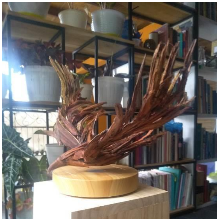
Figure 6. Levitation-Based Wooden Craft.