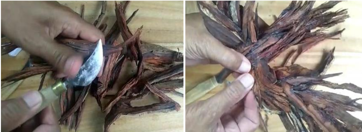
Figure 5. Process of Wood Smoothing. Figure 12. Process of Wood Arrangement and Combination.