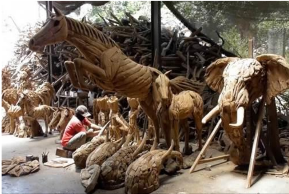
Figure 9. Wood Root ArtWork.