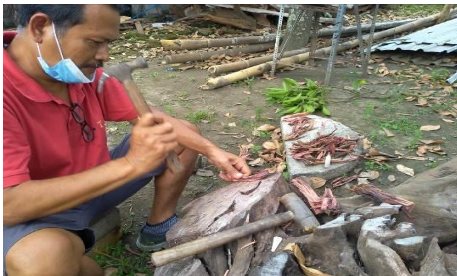
Figure 4. Process of Wooden Waste Cutting.