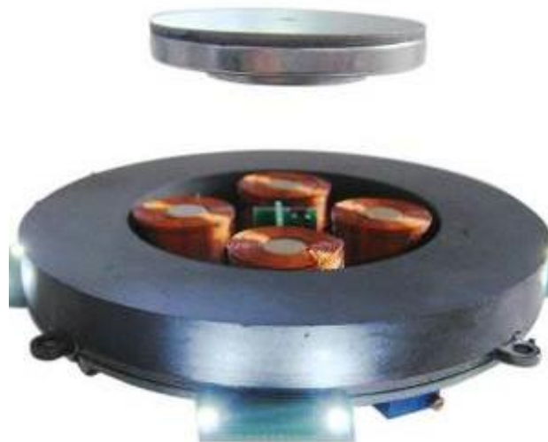
Figure 3. Magnetic Levitation Machine Core Kit Modul With LED Lamp.