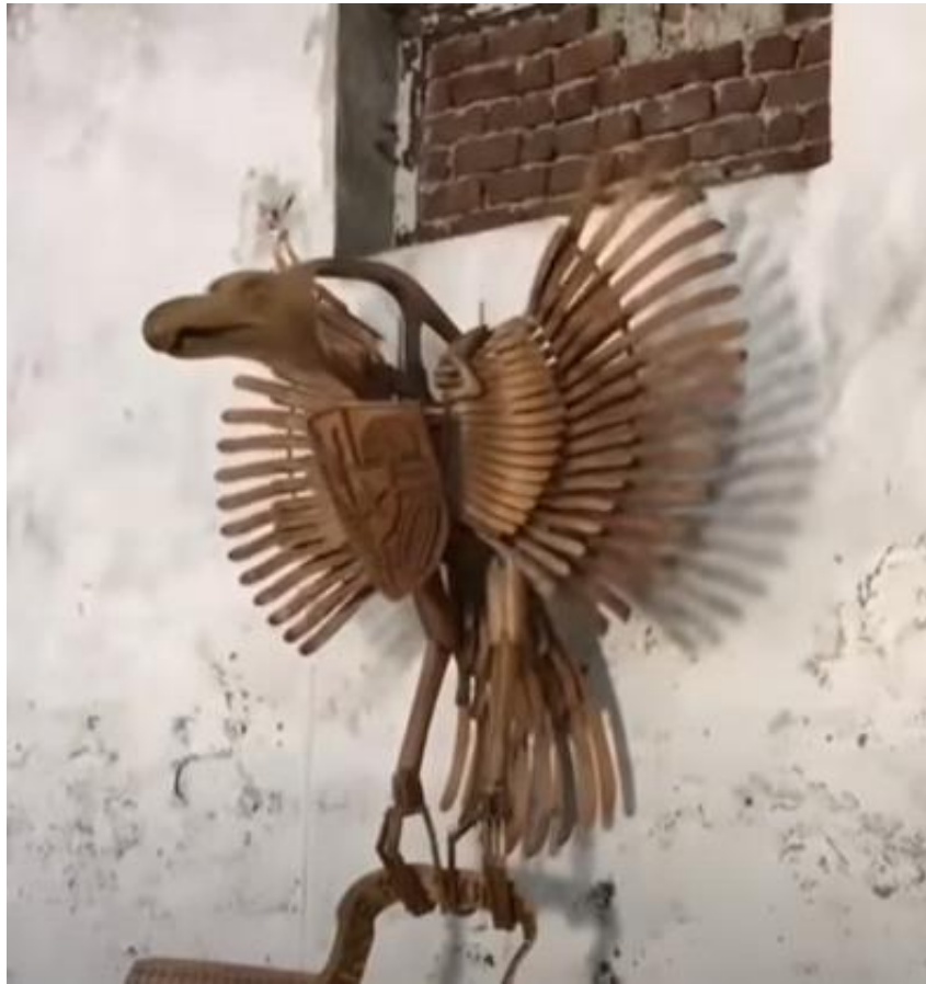
Figure 7. Kinetic Garuda by Dedy Sofyanto

moving) become more dynamic. However, the resulting movements are monotonous because of the limited movement patterns. Such this application of technology is often referred to as Kinetic work.