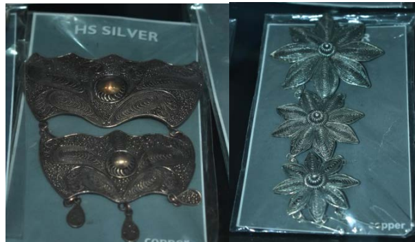
Figure 1. Examples of HS Silver Classic Style Jewelry

In the past, HS Silver Kotagede already had many types of jewelry with traditional styles because it followed the times and had various types.