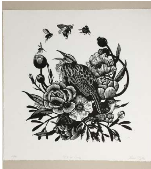
Image 2 Karin Rytter, Rite of Spring ( https://pin.it/5yck3GpNx , 11/5/2023)

The second work to be referenced is a high-relief print work. The high-relief print work of artist Karin Rytter is referred to as a source of inspiration. Captivation is felt due to its beauty and visual complexity. The floral form, layout, and plant tendrils in this high-relief print work will be referenced.