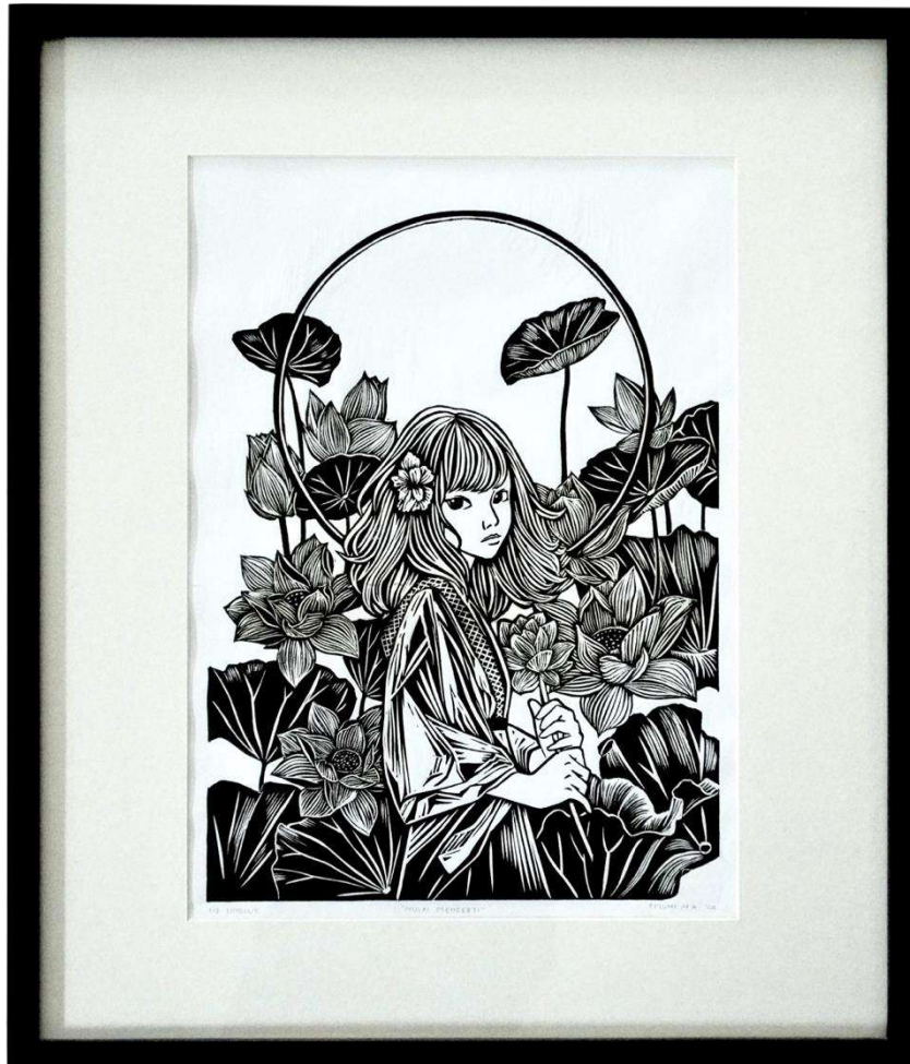
Image 3 Firluna Maungidhotul Hasanah, Begin to Understand , 2024 Linocut on Paper, 30 x 40 cm

The graphic artwork titled "Begin to Understand" measures 30x40cm. The phrase "Begin to Understand" is signified by the realization of the meaning of gratitude, comfort, and the ability to accept strengths and weaknesses without comparing oneself to others. The lotus flower is often symbolized as purity and wisdom in Eastern cultures. Despite being grown in mud, it remains clean and beautiful, symbolizing the ability to grow amidst difficulties. Thus, it is hoped that growth will occur amidst one's own strengths and weaknesses, without comparison to others. Wholeness and completeness are symbolized by the circle, which recognizes strengths and weaknesses without