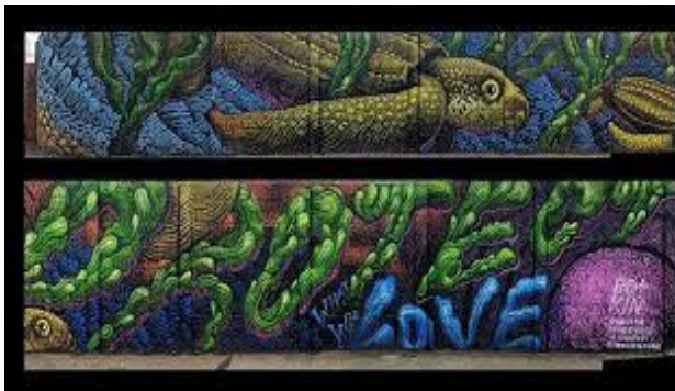
(Figure 7) Mural, Blue Grenada 2017 Artist Jason Botkin