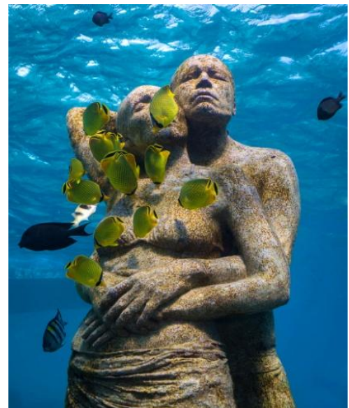
Effective public art Artist: Artist: Jason deCaires Taylor Year: 2015 Location: Indonesia

Underwater sculpture aim to create marine habitats that expand fishery populations and enhance sociocultural opportunities for the communities.