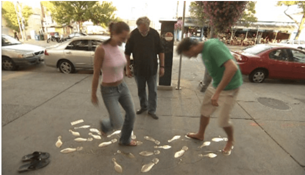
(figure 3) Dance Steps on Broadway Seattle, Washington, United States

For example (figure 3), two strangers may come upon this dance instruction together; sharing this experience they might become friends for a lifetime. This is evident that even a small- scale public art project can change someone's life.