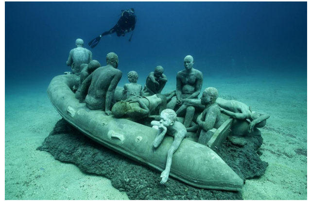
( Figure 4) Raft of Lampedusa, 2016, Artist: Jason deCaires Taylor's, underwater sculpture.

Sculptor and environmentalist Jason deCaires Taylor, use the ocean as his exhibition space. Over the past decade, Jason has built numerous large-scale underwater sculpture parks that contain over 850 life-sized works install all over the world. The pH-neutral materials the artist uses to construct the parks make the sculptures habitable for marine life, demonstrating the definite impact art can have on an ecosystem. His 2016 work, "Raft of Lampedusa"(figure 4), ignites conversations about willful ignorance regarding climate change and the dangers that refugees face. Jason deCaires Taylor's underwater sculpture aim to create marine habitats that expand fishery populations and enhance socio cultural opportunities for communities.