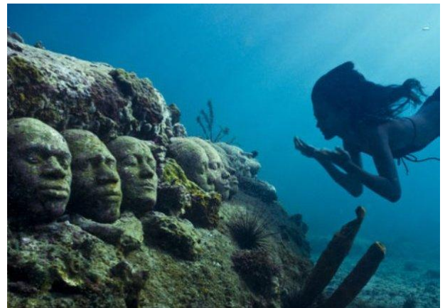
( Figure 5) Underwater sculpture, 2007 Artist: Jason deCaires Taylor

Many of the sunken installations created by artists intended to raise awareness about polluted waters, dying coral reefs, and rising water temperatures. Other pieces tackle humanitarian issues, such as the refugee crisis and the perils of trans-ocean migration. Regardless of the artists' original intentions, the sculptures that wait for visitors beneath the salty water will soon become vessels for aquatic life that shelter millions of sea creatures (Maria Trujillo 2019).