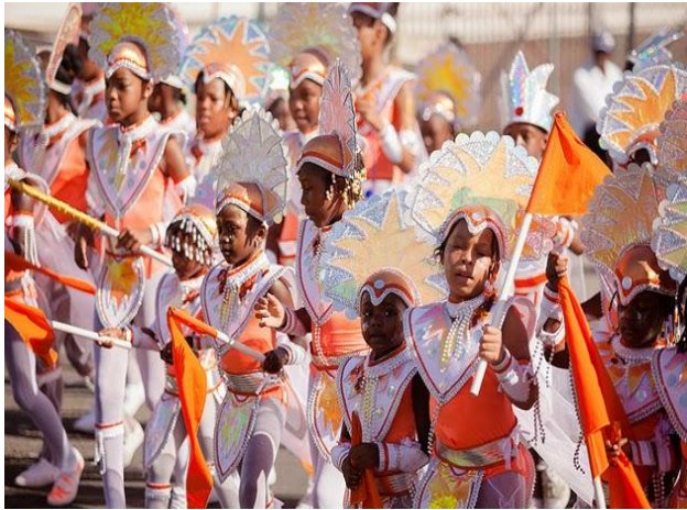
Public art as Festival Location: Trinidad & Tobago

imaginatively conveys the memory, traditions, customs, values, and aspirations of community members.