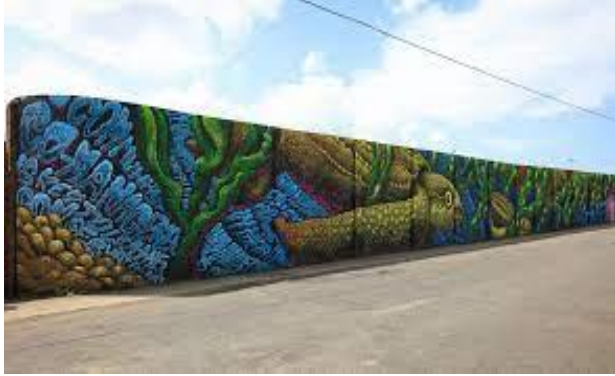
(Figure 6) Mural, Blue Grenada 2017 Artist Jason Botkin Photo: Tre Packard, 2017

Jason Botkin, participant in the 'Blue Grenada' initiative. The 'Sea Walls: Murals for Oceans' project, attempt to connect local communities to ocean solutions through art work (figure 6).