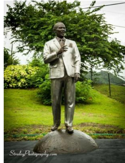
Public art as monument statues Artist: Maria McClafferty Medium: Bronze Year: 2017 Location: Grenada

Artworks of remembrance are used to commemorate an important historical figure or event of public significance. It can consist of figurative or abstract statues, monuments, memorials, and historical markers.