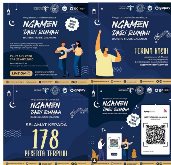
Figure. 4 Ngamen dari rumah programs, held by Kemenkraf collaborated with gopay, had followed by many participant in a week. (Photos from Kemenpar Instagram)

Creative From Home (CFH) held in order to give stimulation to those impacted by the government policy related to COVID-19 whose create and submit musical works and a musical performance from home will be given incentives through this program. It was motivated by the economical creative chain in the old paradigm referred to Ikatan Penerbit Indonesia (IKAPI) data that, Since Covid-19 outbreaks has become a pandemic, IKAPI recorded the data as a fact that 95% selling has dropped, among them 50% would have terminated their worker, and 25% would have stopped their production.