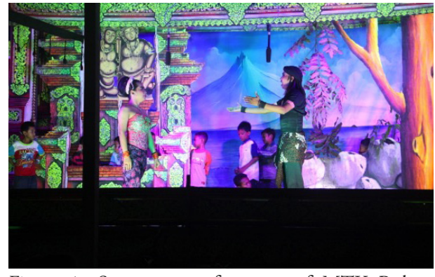
Figure 1: Sangposangan fragment of MTK Rukun Famili.

MTK consists of some parts which are opening music, srimpi/bedaya dance, comedy (similar to Ludruk) and main or play ( ketoprak play which contains sangposangan fragment). In its music, MTK uses music of Madures gamelan by playing