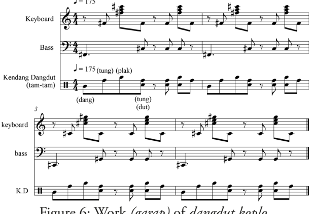
Figure 6: Work (garap) of dangdut koplo.

In the same part, in the middle to 'pos', dangdut koplo rhythm becomes more complex when kendangan instrument of dangdut koplo change to techno (electric) drum instrument. Kendang player which in first plays kendang instrument then changes to play electric pad drum. This electric pad drum instrument is programmed to create techno (electric) drum sound through sampling technology. This instrument change also brings influence to music nuance. Rhythm of dangdut koplo then seems to transform to be EDM (disco) music. Here is a piece of transcription and documentation of its performance (see Figure 7 and 8).