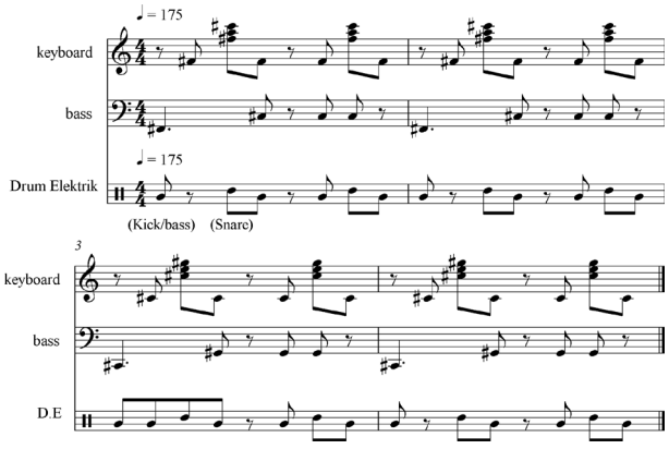
Figure 7: Work of dangdut in EDM version.

The use of EDM musical idioms can be read as an effort by the Madurese community to overcome modernity. EDM is not a new music genre, it has been around since the 1970s (Aryandari, 2019, p. 89), but in the context of Madurese society it is seen as a symbol of modernity built with advances in technology. The presence of EDM music amidst traditional music then gives a new and interesting color to articulate. In semiotics, it might help that the