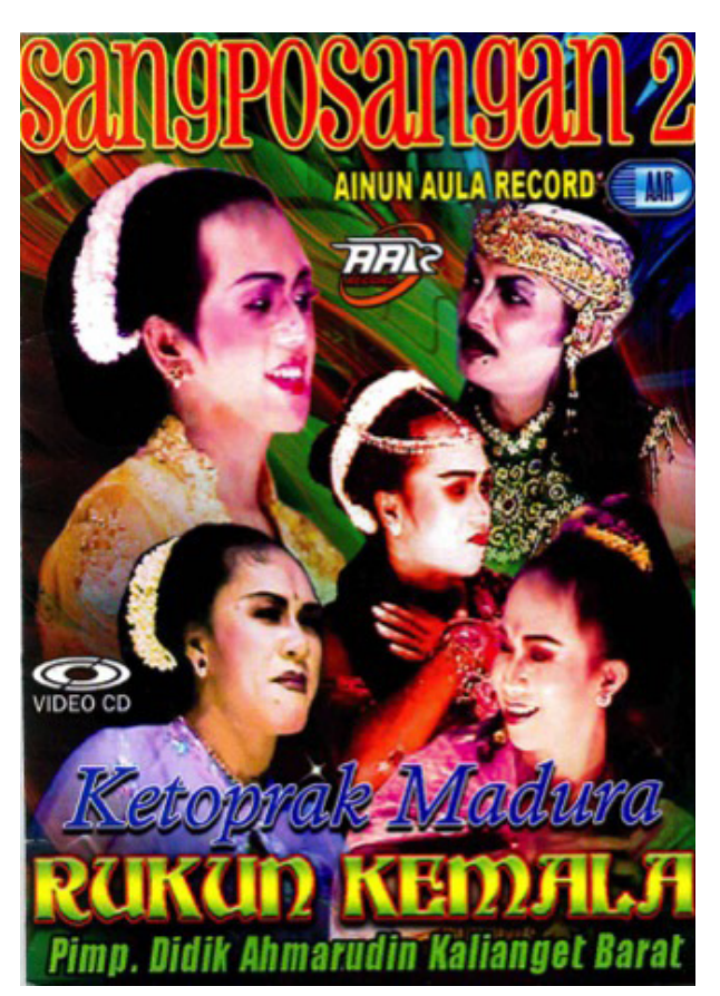
Figure 2: CD cover Sangposangan MTK Rukun Kemala.

Sangposangan also presents kèjhungan which is Madurese song related to the play. Kèjhungan