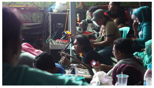
Figure 8: Players of keyboard, bass, kendang dangdut and pad drum.